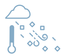
Can last a few hours or several days