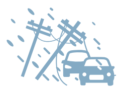
Can knock out heat, power, and communication services