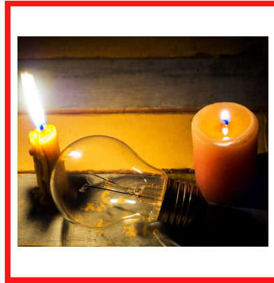
power is out