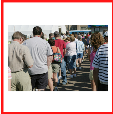
waiting in line to get inside