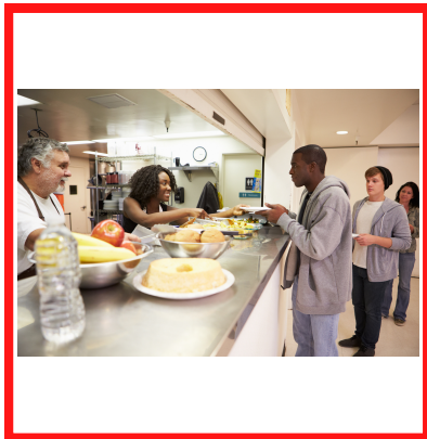
food and water